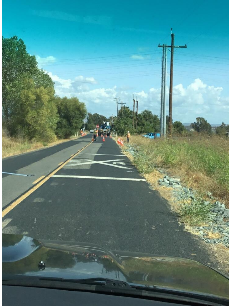
Photo 1: Crews were observed installing guard structures at site 6/52 and traffic control signs and flaggers were implemented along Cox Lane, in accordance with the Traffic Control Plan and MM TRA-1.