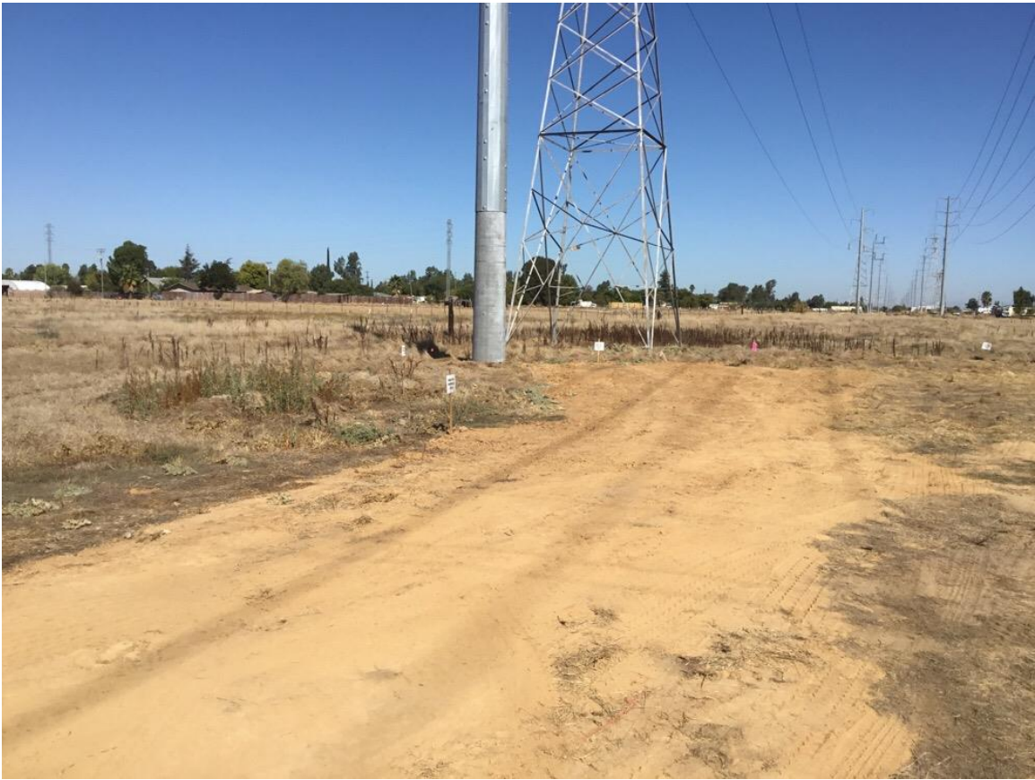
Photo 3: Sensitive resources were marked clearly at site 29/213 and avoided in accordance with APM BIO-3.