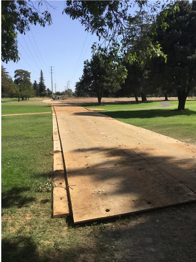
Photo 4: Driving plates were installed to provide access to work sites within a golf course and to prevent track-out between sites 24/176 and 24/177, in accordance with the project SWPPP.