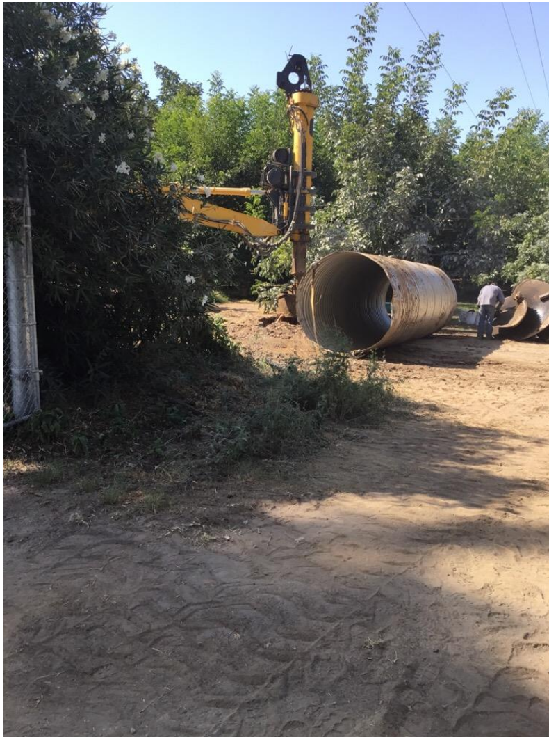
Photo 2: Drilling work for foundation installation at site 24/176.